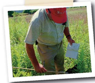
Regular environmental monitoring of the Malvern area (Toronto, ON) is conducted by LLRWMO staff.

A number of properties in the Greater Toronto Area are currently under licensing exemption by the CNSC. Contact with the owners of these sites and provision of information on their obligations is regularly provided by CNSC staff in accordance with the Nuclear Safety and Control Act (NSCA). The property owners have agreed to contact the CNSC and the LLRWMO in the event that they wish to renovate, excavate or construct in the areas that have been identified to them as mildly contaminated. The LLRWMO provides technical